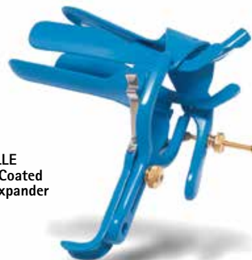
ES-16132-LLE Large LETZ-Coated Four-Way Expander

also available in uncoated stainless steel and autoclavable resin models