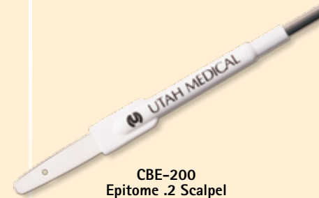
CBE-200 Epitome .2 Scalpel