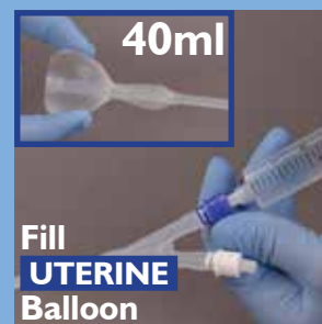
40ml Fill UTERINE Balloon