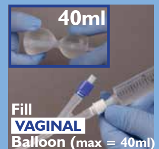
40ml Fill VAGINAL Balloon (max = 40ml)